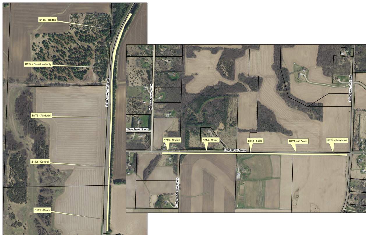
Test plot locations for pollinator habitat along roadsides in Denmark Township, Washington County, Minnesota

The Local Operational Research Assistance (OPERA) Program encourages maintenance employees from all cities and counties to get involved in operational, “hands-on” research. OPERA helps to develop innovations in the construction and maintenance operations of local government transportation organizations and share those ideas statewide.